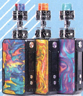
vape tanks/ mods